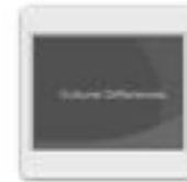
3. Cultural Differences.ppt