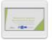
2. STARS Programm.pptx