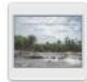
5. Comunity based tourism.ppt