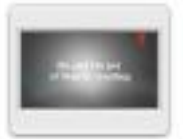
4. DO AND DONT.pptx