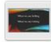
1. Discover MAdurawala.pptx